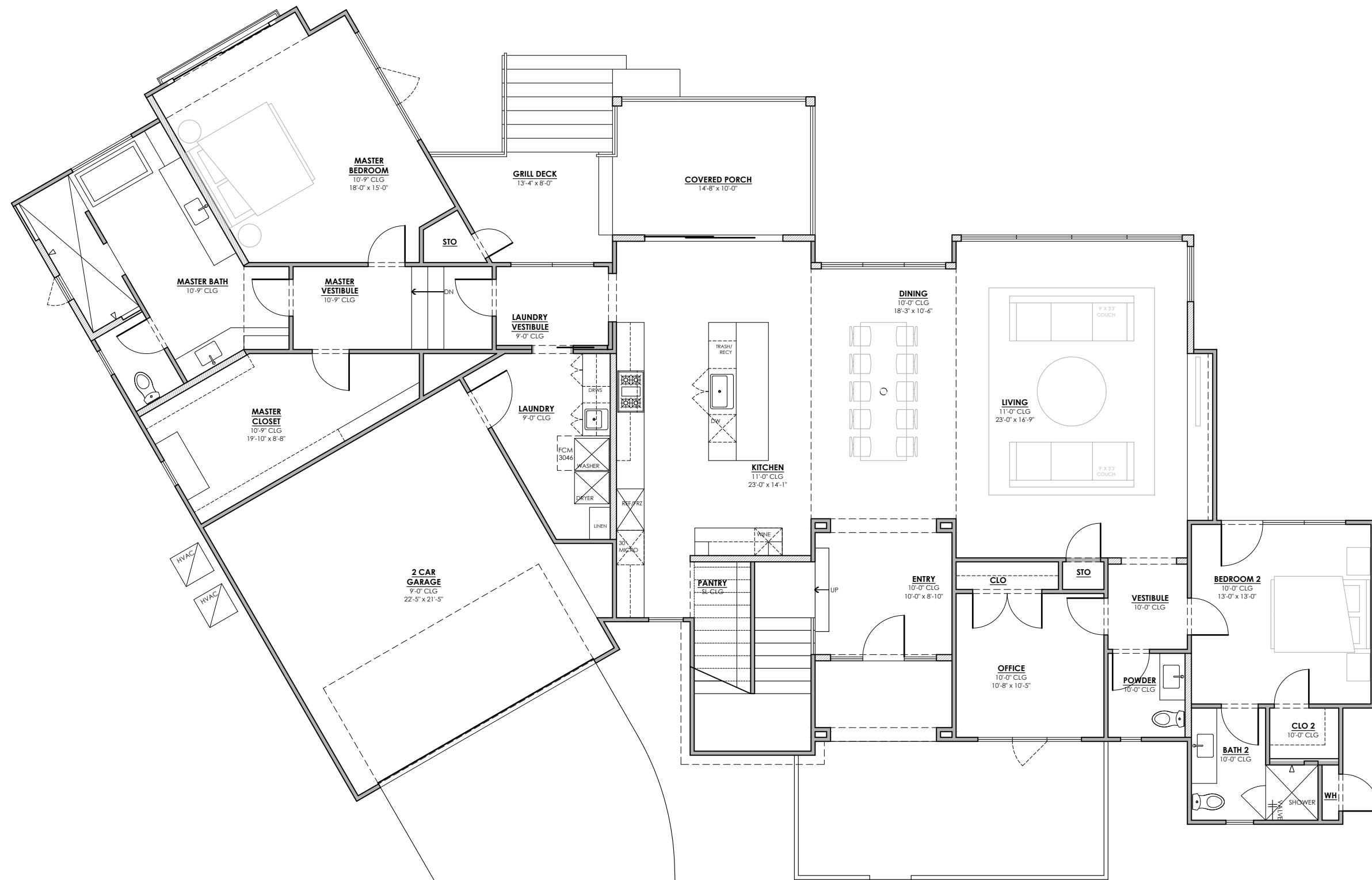
1 FIRST FLOOR PLAN Scale: NTS

Due to product availability, plan modifications, and market conditions, these specifications are subject to change at any time without notice. All items are subject to individual availabilities and equal substitutions may be made at the sole discretion of Jack Boothe Construction, LLC.