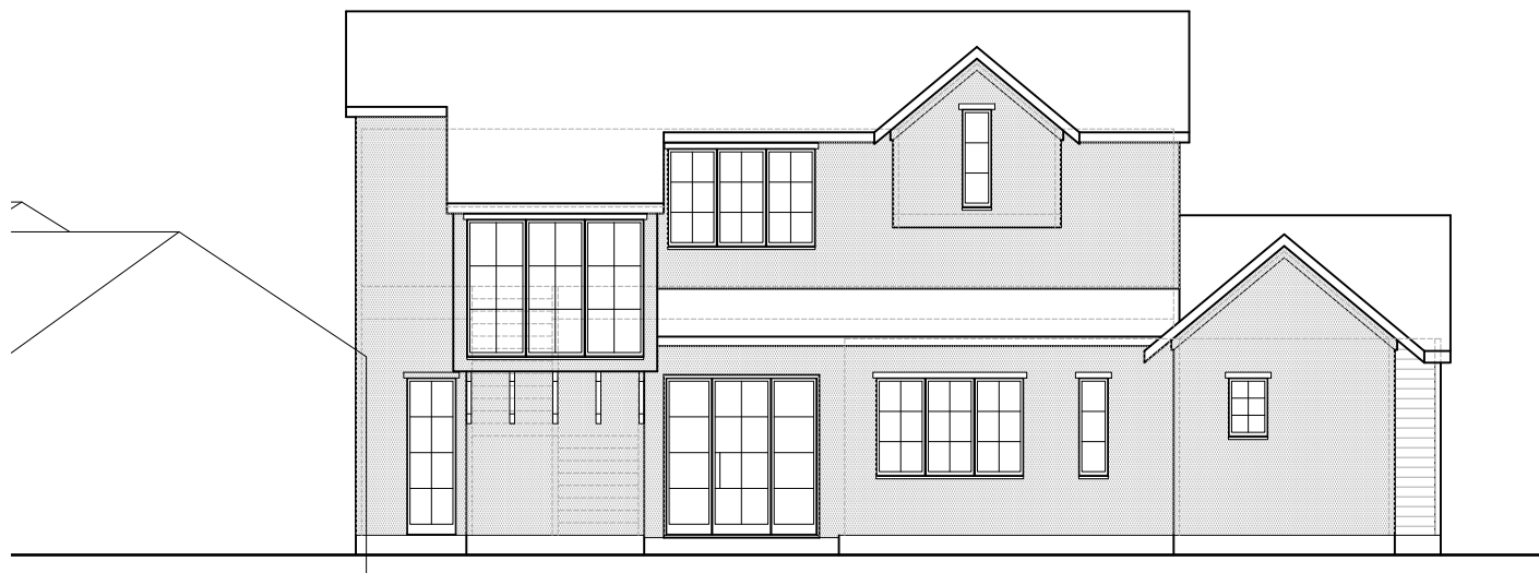
2 FRONT ELEVATION Scale: NTS